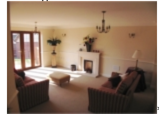
Typical room Pictures

Sovereign Country Homes Reserves The Right To Change The Above Specification If Desired